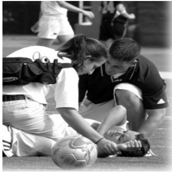
Athletic Trainers at work.

Sports medicine involves health care professionals, researchers and educators from a wide variety of disciplines. Its function is not only curative and rehabilitative, but especially preventive. The sports medicine "team" includes specialty physicians and surgeons, athletic trainers, physical therapists, coaches, and other personnel.